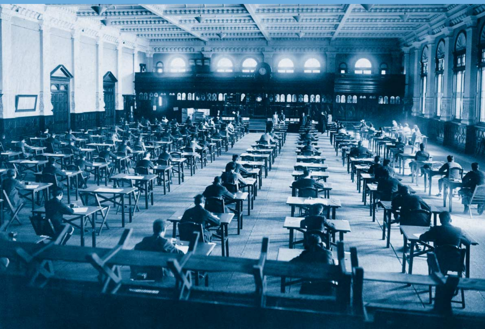
Unidentified examination room c. 1910.